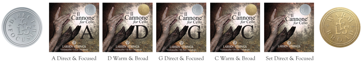
A Direct & Focused D Warm & Broad G Direct & Focused C Warm & Broad Set Direct & Focused

Both C and G strings have steel rope cores and tungsten windings, while both Ds and the 'warm and broad' A have solid steel cores and stainless steel windings. The 'direct and focused' A string uses a unique material that is currently being patented.