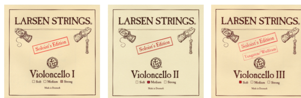
A Soloist Strong D Soloist Medium G Soloist Soft

The strings are based on solid steel cores, different in properties and dimensions from their regular counterparts – made for the demanding soloist player.