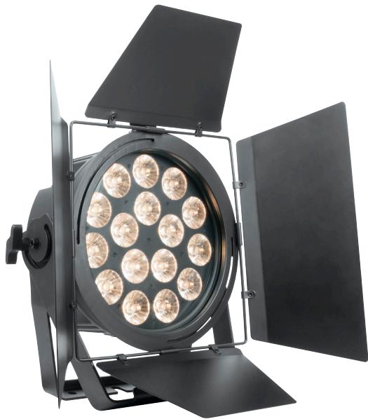
Optional Gel Frame and Barn Doors Available